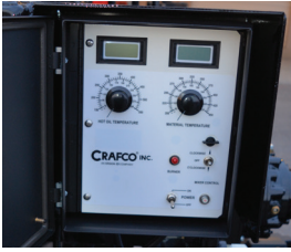
Digital controls for temperature accuracy