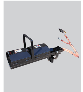
Optional heated swivel chute (On Patcher II models only)