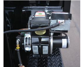
Fuel-efficient and easy-accessible burner