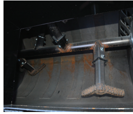
Staggered, angled agitation blades for thorough material blend and to sustain aggregate suspension